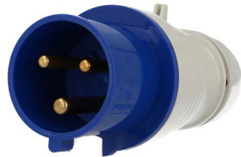
Monophase socket P17 16A 220V