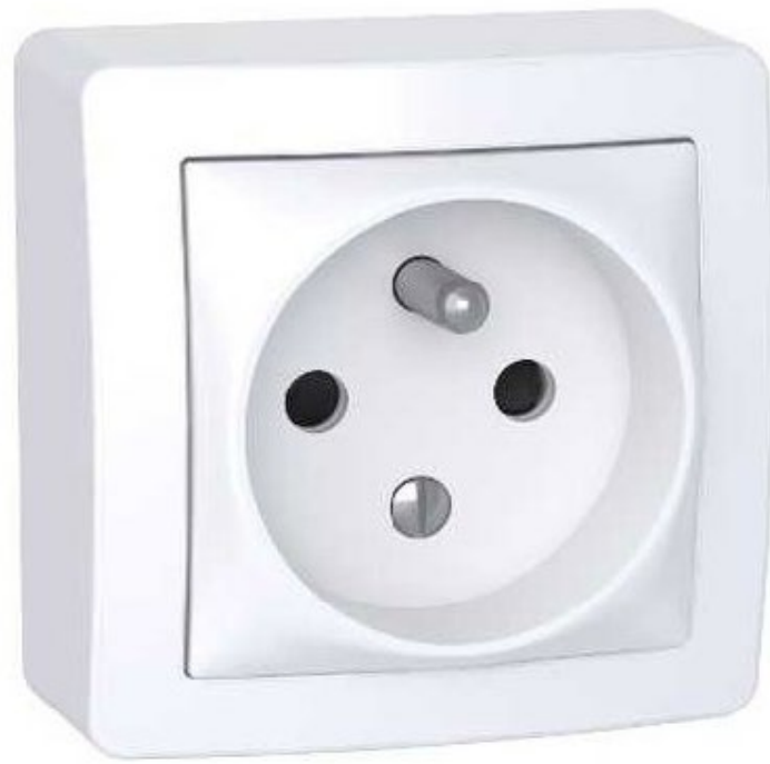
Monophase socket (16A 220V) (3kW maximum)